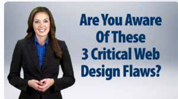
This is the EXACT SAME video hosted on our website. This can be found at powermarketing.net/boise-web-design . (Yes, it has rounded corners on the video.)

At Power Marketing, we host our client's videos for them and triple encode all of our videos for our clients so that they play back seamlessly in HD (High Definition), SD (standard definition), and on mobile devices without forcing visitors to leave the page. And yes, they work perfectly on iPads and iPhones, everytime—even when streaming over cellular networks. Additionally, we always custom create a video thumbnail so that visitors to your website will want to push play and actually watch your video.