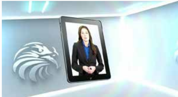
This is the actual thumbnail for one of our videos on YouTube (find the video on YouTube by searching for "Boise Web Design")

one on the right is the same video with a customized thumbnail on our website. Which one would you be more inclined to click and watch?